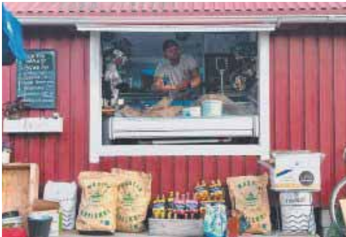
Clockwise from above: Möja, an island in the Stockholm Archipelago; the ferry to Möja leaves from Sollenkroka; the popular Les Poissonniers de Möja restaurant.

My husband and I wake up early in Barnvik, less than an hour from central Stockholm. From there, we take a bus to Sollenkroka Brygga (pier), a popular jumping-off point for the archipelago, and catch a ferry to the island of Möja. After disembarking, we set off on a 13.8km section of the Stockholm Archipelago Trail that mostly hugs the coastline, passing fishing villages dotted with traditional red cottages. Beside the road, bees and butterflies flit from clover to meadowsweet to heather. Though the official trail on Möja follows a rough gravel road, we wander onto unmarked forest paths where carpets of wild blueberries grow in dappled shade. Our fingers take on a purplish hue as we forage. We reach the village of Berg where we break for fika – the Swedish version of smoko. Pulling up seats at one of the bakery’s outdoor tables, we sip coffee and snack on kardemummabulle (cardamom buns) with their sweet, gritty, glazed crowns. From here, it’s a short stroll to Möja Church. A map from 1630 shows a small wooden chapel standing on the site of the current church. This chapel was the only building left standing when Russian soldiers razed the island in 1719. stockholmarchipelagotrail.com; visitmoja.se Afternoon Seafood platters are the biggest seller at Berg’s lively alfresco restaurant Les Poissonniers de Möja. But between blueberries and buns, we’ve left insufficient room. Instead, we eat fish and chips paired with glasses of white wine.