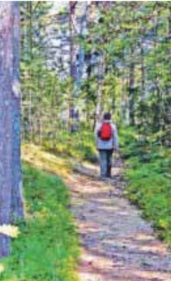
From top: Sandhamn in the Stockholm Archipelago; butterflies are ever-present on the Nämddö path; hiking through a pine forest on Sandhamn.

up with fika – choosing kanelbulle (cinnamon buns), which are so beloved that Swedes celebrate Cinnamon Bun Day on October 4 every year. We also stash sandwiches to eat along the way. The 13.1km trail on Nämddö offers more varied terrain and a notch more challenge than the previous two days. We spot fruiting cherry and apple trees dotted amid the birch and pine, step carefully through cattle pastures, wander through meadows scattered with wildflowers, and pause to listen to the susurrrus of winds through open grasslands. namdosolvik.com Afternoon Tucked away amid the trees, on the edge of a