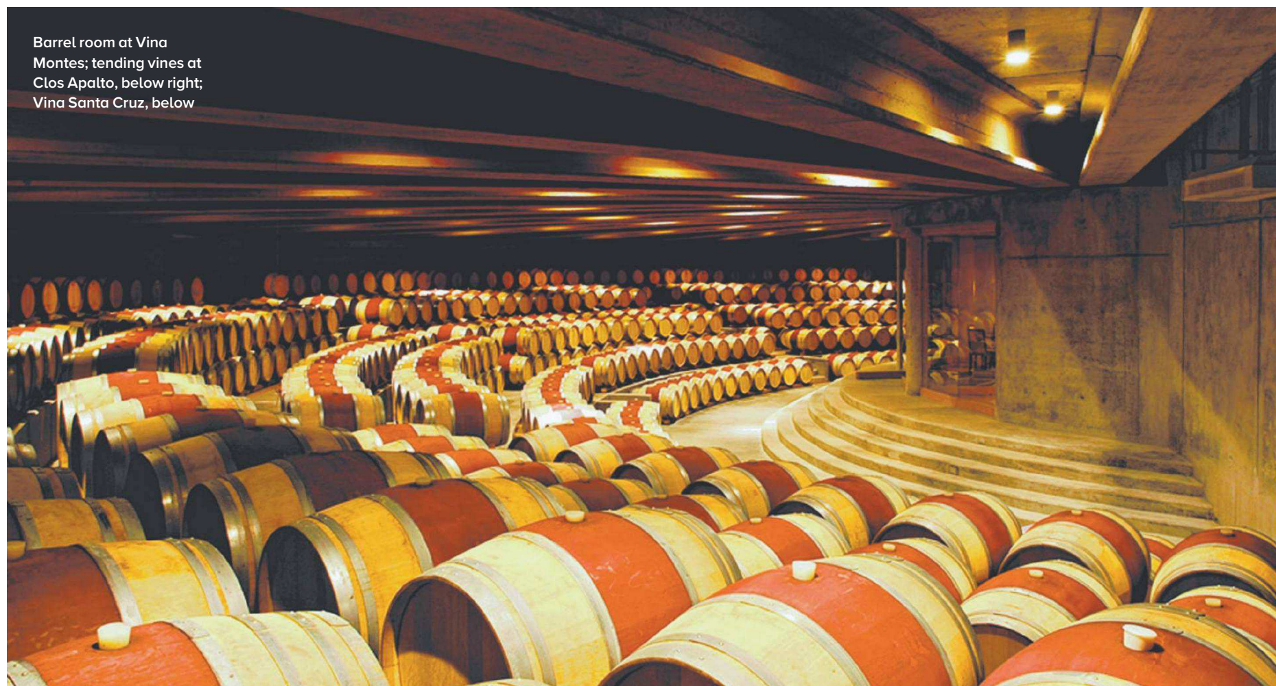
Barrel room at Vina Montes; tending vines at Clos Apalta, below right; Vina Santa Cruz, below